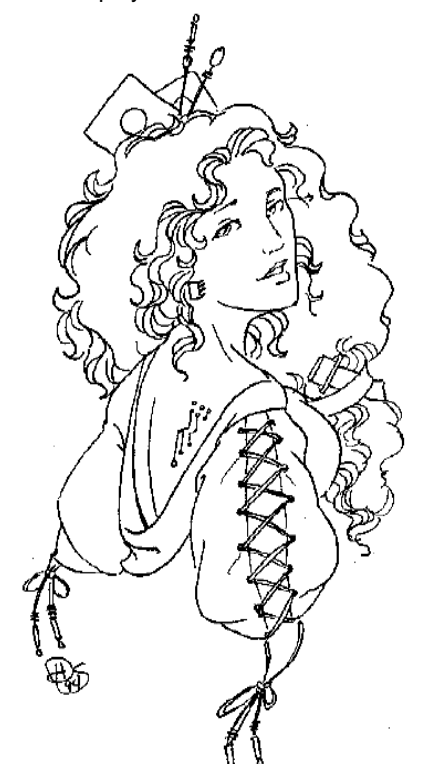
© 1997 Garry Stahl Reprint only with Permission, for private use only

When the caster utters the spell of Winged Fury , he calls forth a mass of from 500 to 1,000 ([1d6 + 4] x 100) small birds. This aerial ameboid mass swarms in an area 20 yards square. Upon command from the caster, the flock swarms at 100 feet per round toward any prey within 240 yards, moving in the direction in which the caster commands. The winged fury slays any creature subject to normal attacks, as each of the small birds inflicts 1 point of damage (each then dies after its attack), so that up to 1,000 points of damage can be inflicted on creatures within the path of the Winged Fury . If the winged fury travels more than 240 yards away from the summoner, it loses 50 of its number for each 10 yards beyond 240 yards. There are a number of ways to thwart or destroy the creatures forming the swarm. The solutions are left to the imaginations of players and Dms.