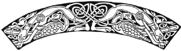
Table R10; Sauroi Breath Weapons